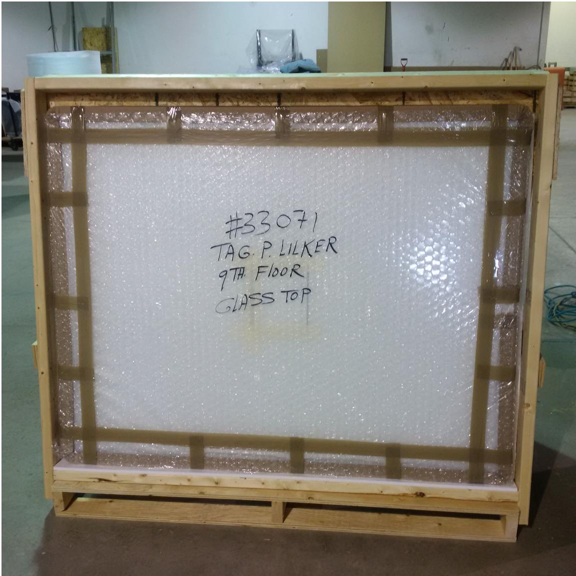
4b) FOR PAINTED BACK GLASS TOPS – corrugated edge protection is used around the entire top perimeter. Surface is wrapped in light foam paper with an outer layer of bubble wrap taped to the corrugated edge